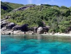
ANSE DU RIZ